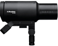
Pro-D3 Powerful and reliable flash for high-speed shooting