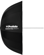
Umbrella Deep Translucent Versatile light-shaping for soft, even lighting