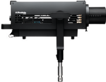
L1600D High-performance continuous LED for video